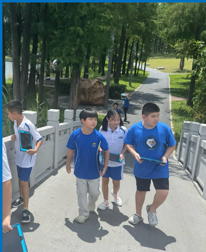
Grade 5 students enjoy their ParkLab Class on a beautiful day